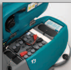
Long-lasting battery packs