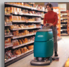
Machine in action